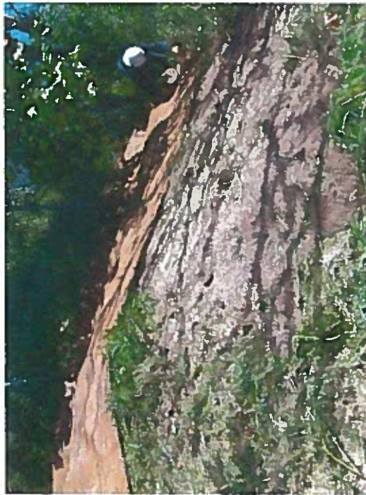
3. Area 1 placement of erosion blanket.