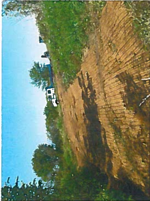
7. Area 2 placement of erosion blanket.