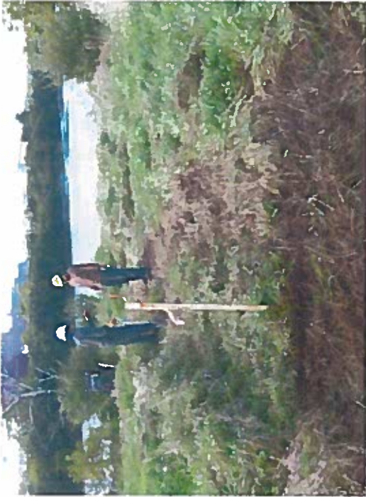
5. Area 2 prior to repair work.