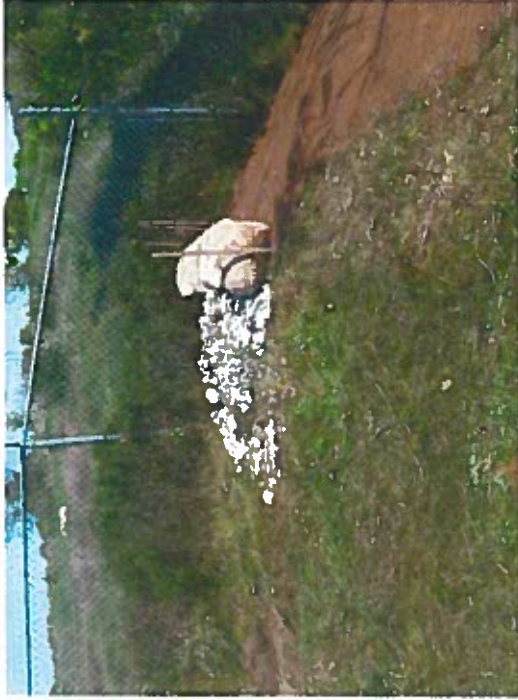
4. Area 1 with straw log and 3-inch stone to impede channeling runoff.