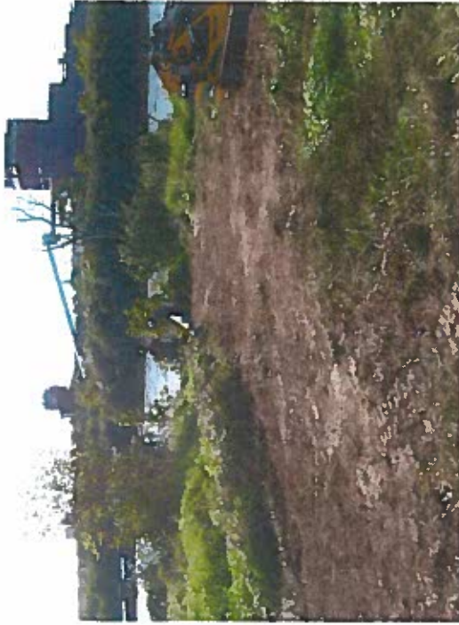
6. Area 2 fill with clayey topsoil.