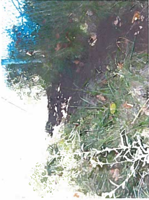
2. Area 1 rill filled in with clayey topsoil.