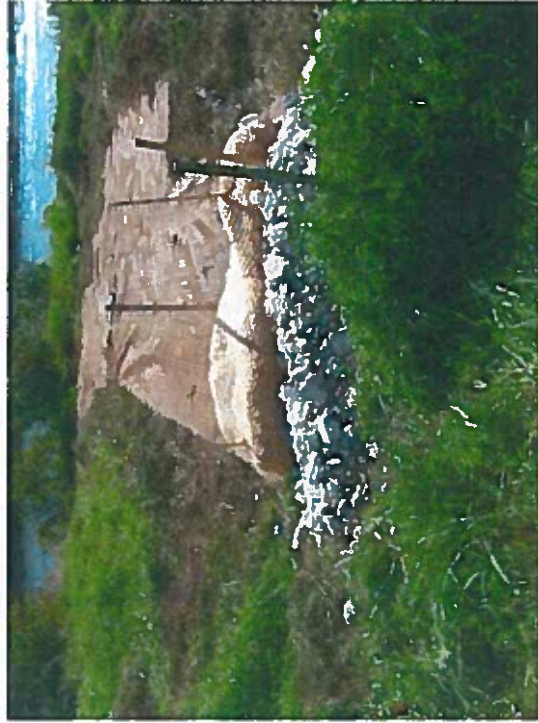
8. Area 2 with straw log and 3-inch stone to impede channeling of runoff.