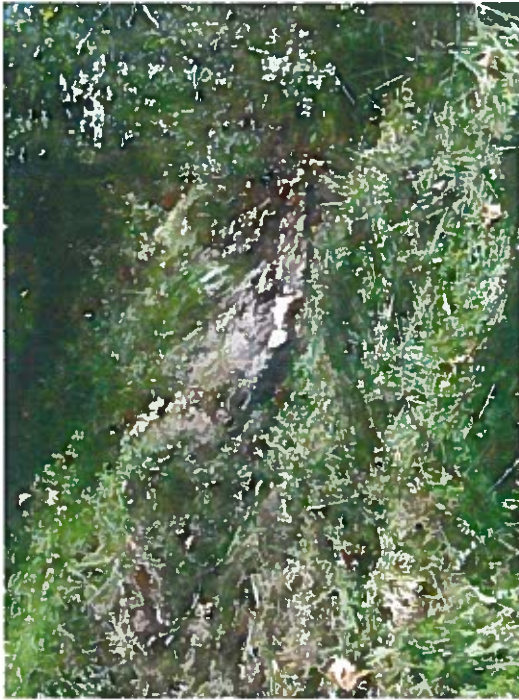
1. Area 1 prior to repair work.